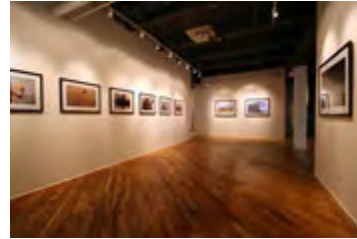
9 Toronto Image Works