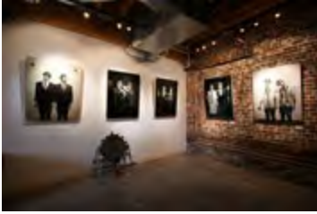
5 Pikto Gallery