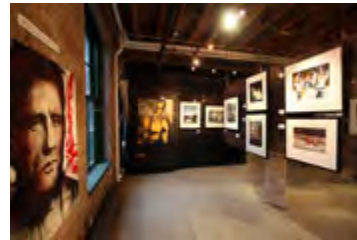
10 SPORT Gallery

http://www.blogto.com/toronto/the_best_photography_galleries_in_toronto/