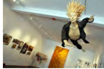
8 The Elaine Fleck Gallery