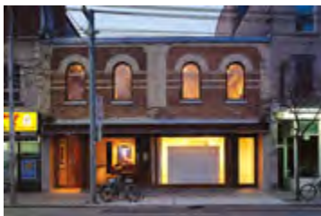
1 Stephen Bulger Gallery

In our Best of Toronto survey, a wide-range of photography galleries were selected by our readers. Community-based and artist-run galleries like Gallery 44 and Gallery TPW offer exhibition space for their members. Pikto and Toronto Image Works display photos and also provide a wide-range of photography services in their store. In addition, readers highlighted more traditional individually curated venues, such as The Elaine Fleck Gallery and, our winner, the Stephen Bulger Gallery.