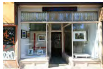
4 Lens Factory