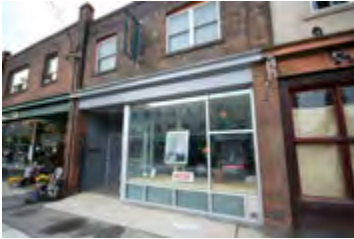
6 Pentimento Fine Art Gallery