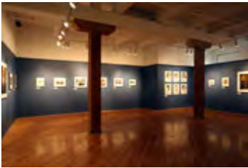
7 Ryerson Gallery